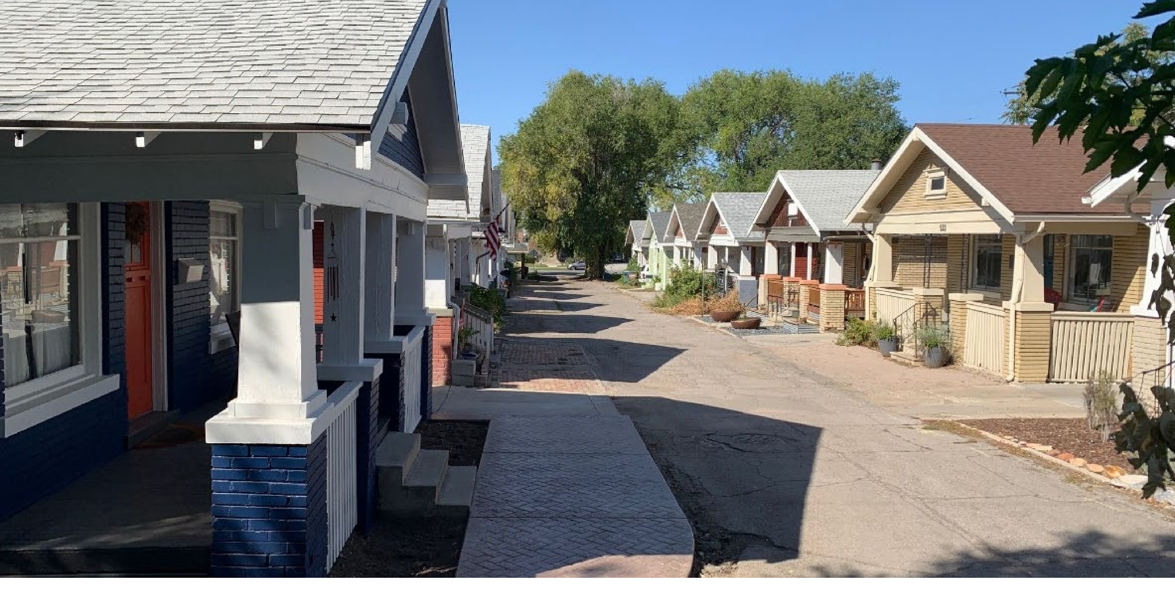
Salt Lake City // Planning Division