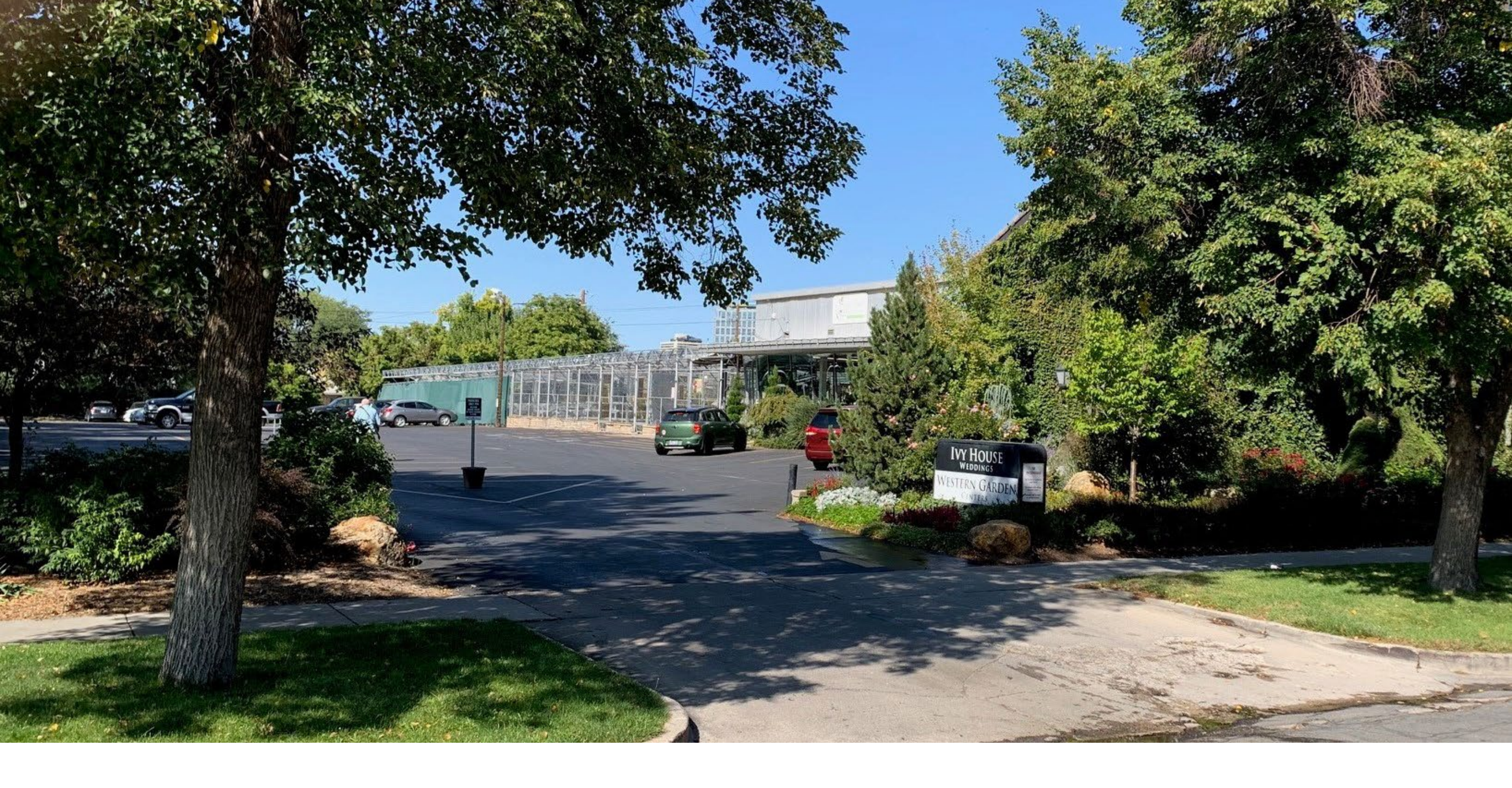
Salt Lake City // Planning Division