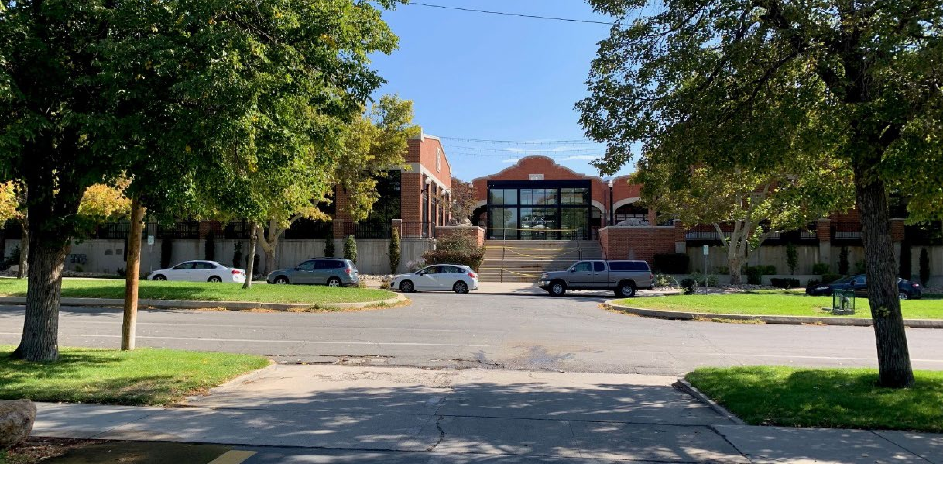
Salt Lake City // Planning Division